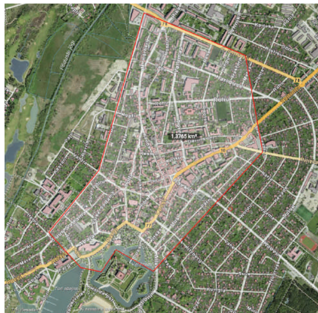
Drawing 1 - Kuressaare forbidden area no. 1

Forbidden area no. 2 (marked on drawing 2) - in this area it is forbidden to remain or move through from 28th august at 11.00 until the end of the competition. This area does not contain the central square of Kuressaare, Lossi street and Allee street.