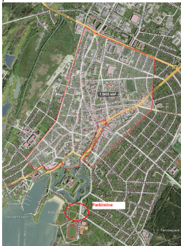
Drawing 2 - Kuressaare forbidden area no. 2 (Parkimine = parking)

Forbidden area no. 1 is marked on drawing 1 - in this area it is forbidden to organize trainings or move with a map until the competitions.