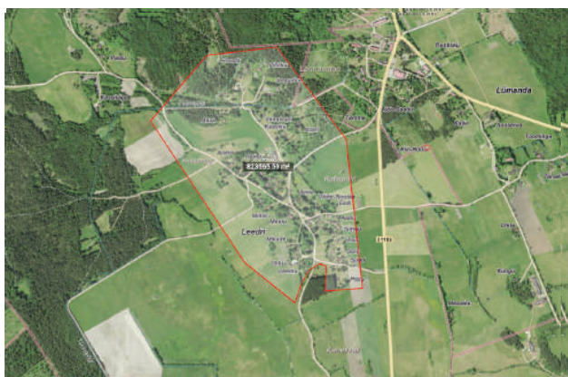
Drawing 4 - Leedri village forbidden area.

In the Pidula-Teesu forbidden area (drawing 3) it is not allowed to move with a map or to organize trainings until the competitions.