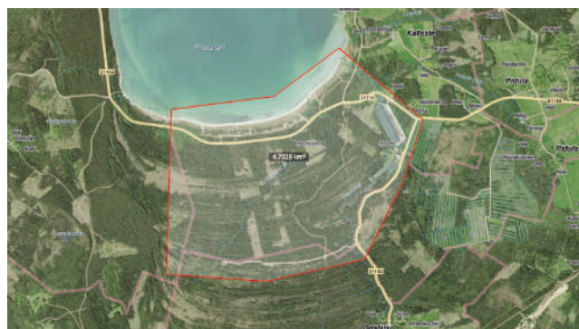
Drawing 3 - Pidula-Teesu forbidden area.

Forbidden area no. 2 (marked on drawing 2) - in this area it is forbidden to remain or move through from 28th august at 11.00 until the end of the competition. This area does not contain the central square of Kuressaare, Lossi street and Allee street.